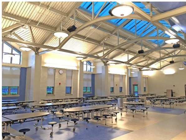
Cafeteria with plenty of natural lighting

The new Monomoy Regional High School, as a “High Performance Green School” will improve students test scores, improve teacher satisfaction, reduce facility’s energy cost, and enhance environmental stewardship.