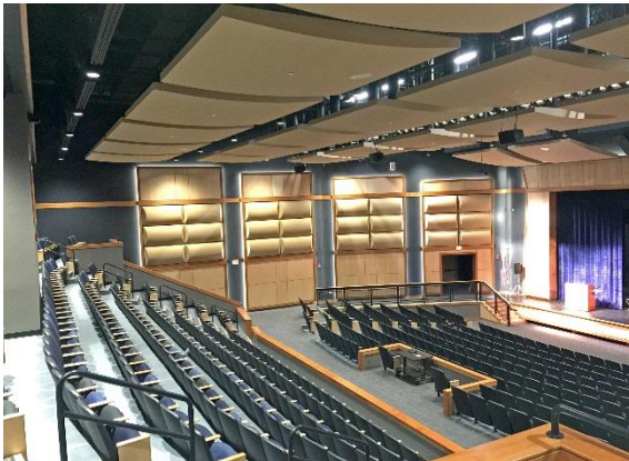
A look inside the updated auditorium at Monomoy

The school includes bicycle racks and paths to discourage use of automobiles to get to and from the site. Recreational fields are equipped with moisture meters to efficiently monitor watering needs for maintenance personnel.