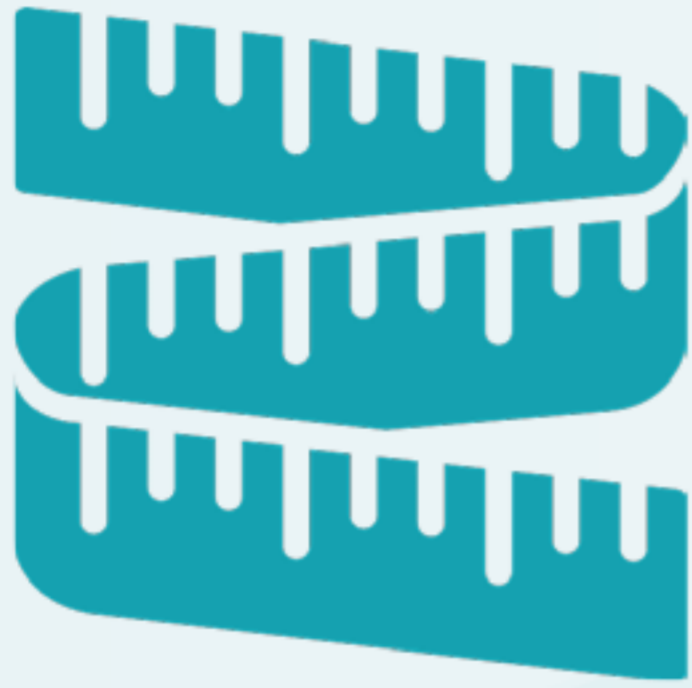
Advanced Evaluation, Measurement & Verification (EM&V) Leadership Forum

The Leadership Forums aim to be a quarterly convening of invited influencers to assess regional progress, highlight inspiring successes, and explore trends, needs and options to advance the related topic.