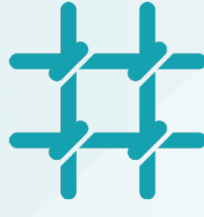
Northeast Strategic Electrification Leadership Forum