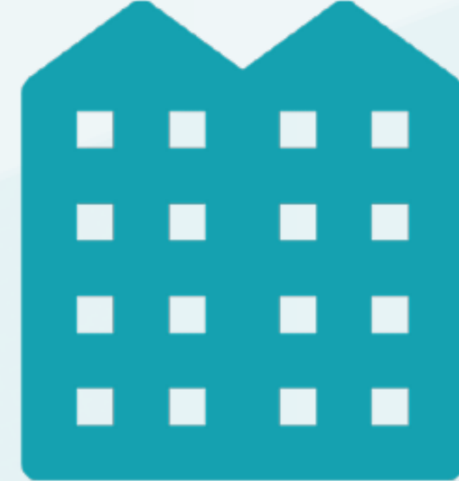
Resilient, High Performance Communities Leadership Forum