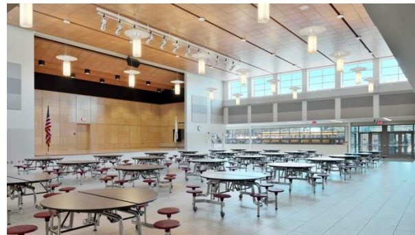
"School as a Teaching Tool"