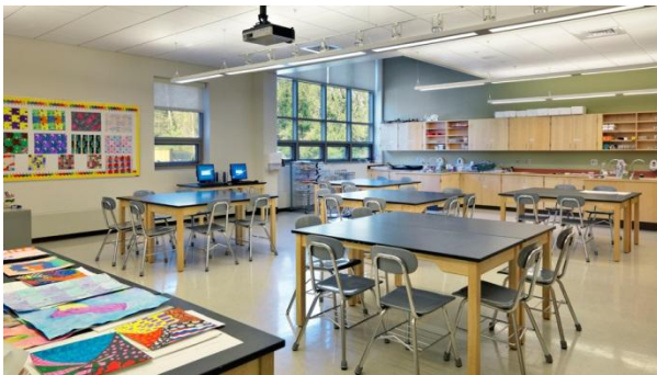
Building design maximizes use of natural daylight

The school's configuration along an east-west axis helps to optimize solar orientation